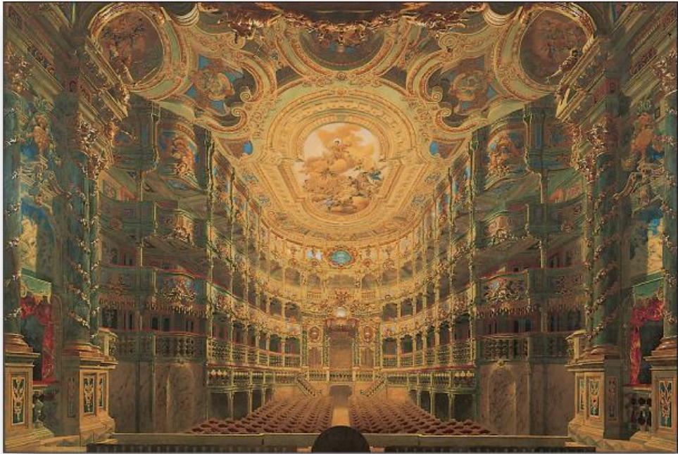
Margrave's Opera Theater, Bayreuth 1879