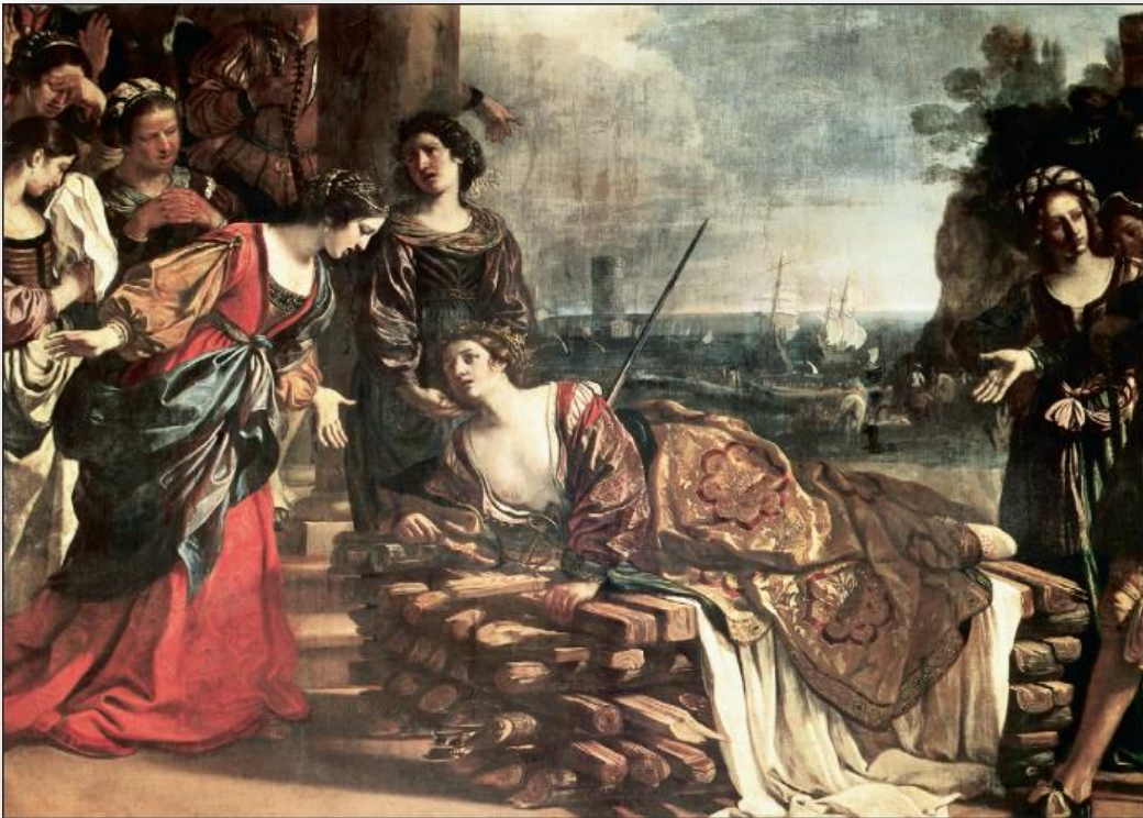
Giovanni Barbieri (1591-1666), The Death of Dido