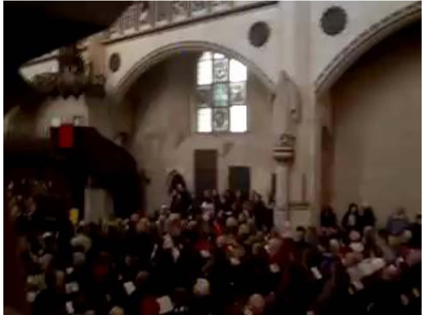
Wittenburg Schlosskirch, October 2007