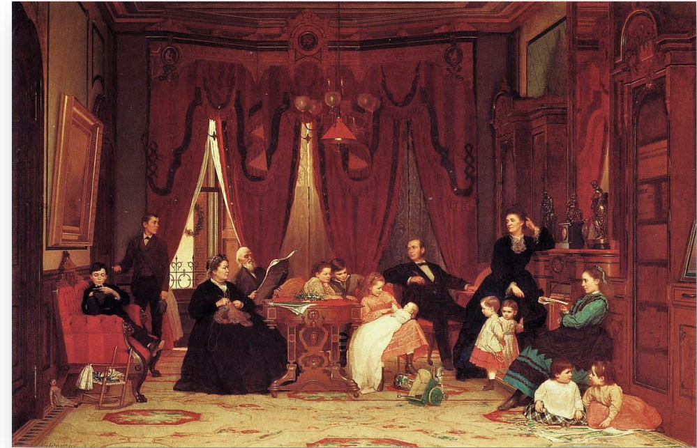
Eastman Johnson (1824-1906), The Hatch Family