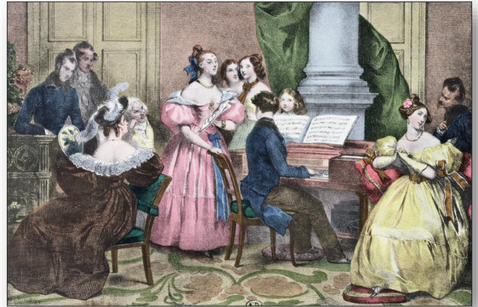
Achille Devéria (1800-57) – In the Salon