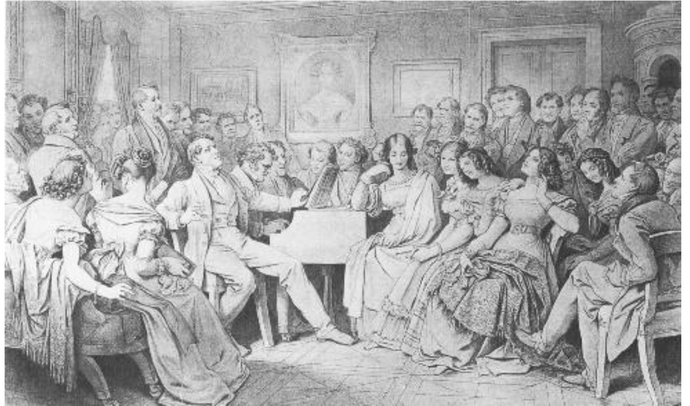
Mortiz von Schwind (1804-71), Schubertiade (1868)