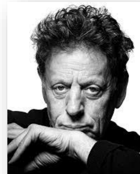
Philip Glass, Einstein on the Beach , “Knee-Play 1” (1975)