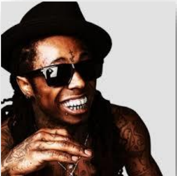
Lil Wayne and Drake, Right Above It (2010)