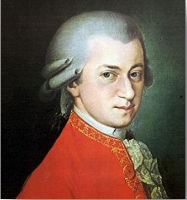
Wolfgang Amadeus Mozart, Duets for Flute and Oboe, “Der Volgelfanger bin ich ja” (1791)