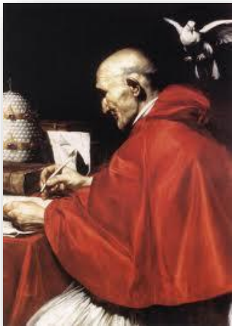
Anonymous, Kyrie eleison