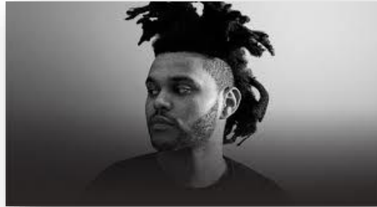
The Weeknd, The Hills (2015)