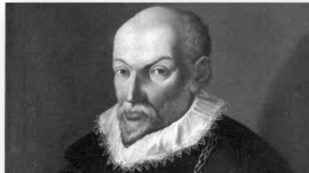
Orlando di Lasso, Kyrie eleison from Missa Bell' Amfitrit, altera (1610)