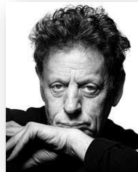
Philip Glass, Einstein on the Beach , “Knee-Play 1” (1975)