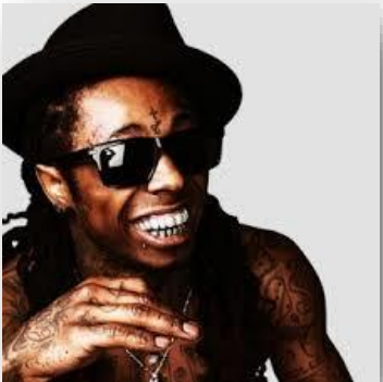
Lil Wayne and Drake, Right Above It (2010)