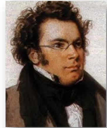
Franz Schubert, Die Forelle (1817)