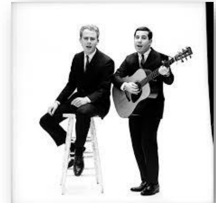
Simon and Garfunkel, Scarborough Fair (1966)